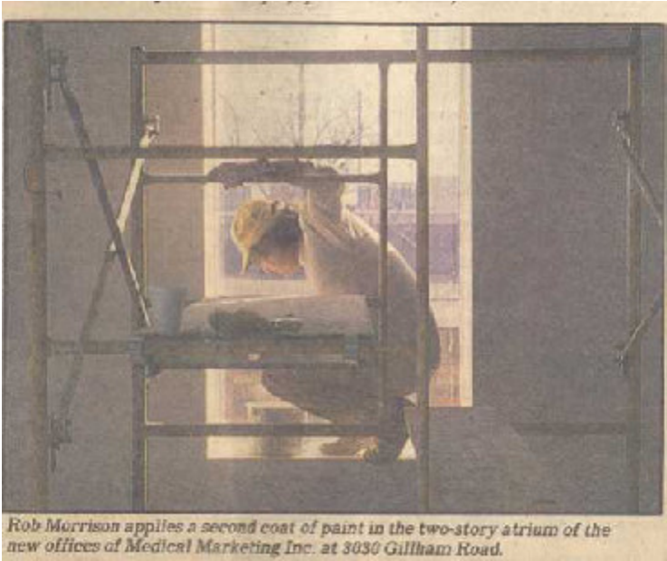
Rob Morrison applies a second coat of paint in the two-story atrium of the new offices of Medical Marketing Inc. at 3030 Gilham Road.